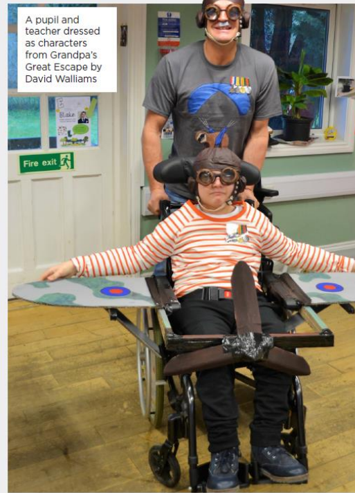
A pupil and teacher dressed as characters from Grandpa's Great Escape by David Walliams